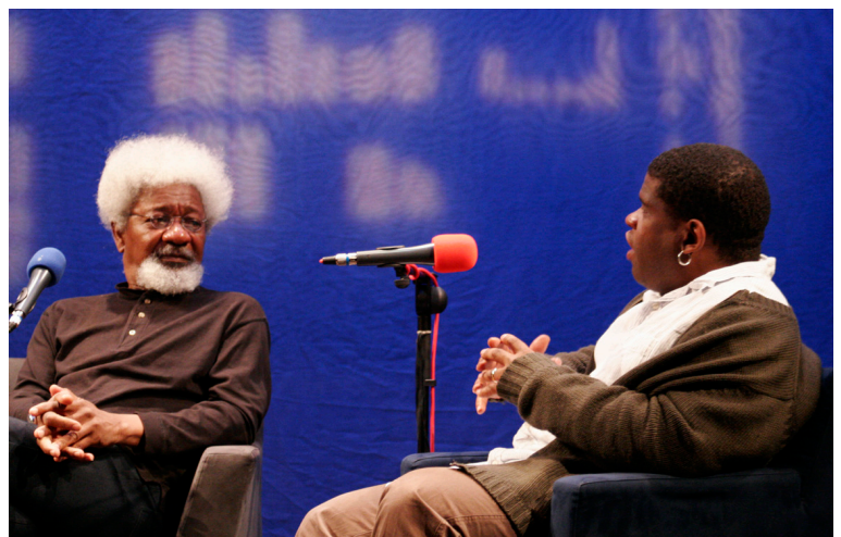
Wole Soyinka and Gary Younge in The Guardian Conversation, PWF 2006

CONVERSATIONS Each day a new conversation, dedicated to a literary or political subject, is held. The hour-long discussions are followed by questions from the audience, inviting free interaction between thinkers and artists, writers and audience. This is why Prague Writers' Festival is considered a festival of ideas.