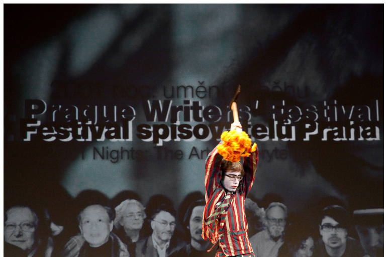
Walter Serner prize 2009

UNIVERSITIES The festival has been connected for many years—by virtue of its focus on humanities, languages and literature—with numerous Czech universities and with New York University in Prague.